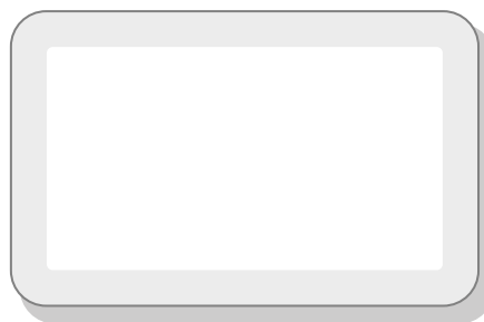
Square 27 x 17 mm