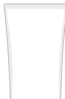
Doypack 450 cc 145 x 200 40+40 mm 450 cc plastic