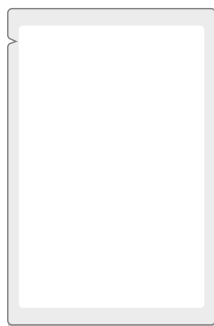
Sachets 100 ml 7-22 x 12-30 cm Al + PP + paper