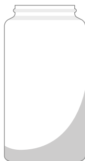
Round jar (PET or HDPE) 100 ml | 150 ml | 225 ml | 300 ml Round jar (HDPE) 40 ml | 50 ml | 75 ml | 110 ml | 200 ml | 275 ml Round jar (HDPE) 160 ml | 450 ml Round jar (HDPE) 30 ml Round jar (HDPE) 90 ml | 130 ml | 150 ml | 250 ml Round jar (PET) 100 ml | 150 ml | 175 ml | 250 ml | 300 ml