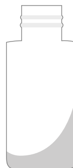
Oval jar (HDPE) 125 ml